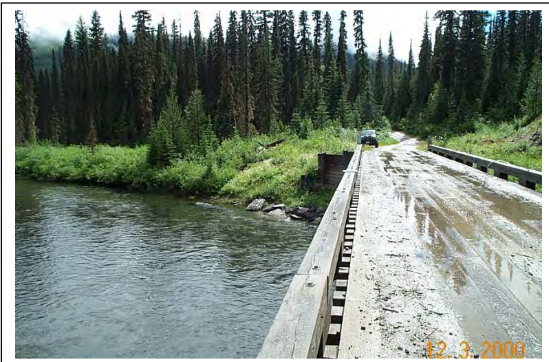
Photograph # 1639. Site J126, score = 0.0 (Low)