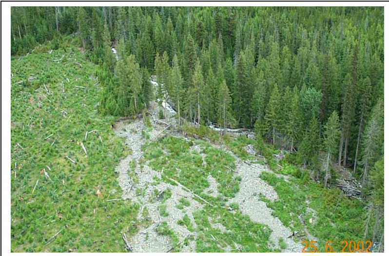
Photograph #1430. Channel avulsion at mouth of Cosmoskey.