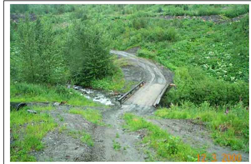
Photograph #1629. SCQI site J121, score = 0.5 (Medium)