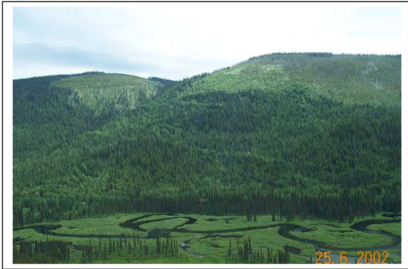
Photograph 1371# Lower McKuskey River