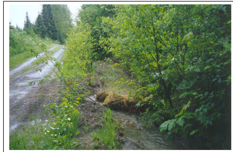
Photograph #Site J13, score=0.95 (High), ineffective ESC.