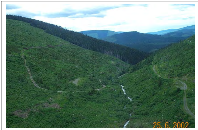
Photograph # 1417 Skyes-fire sub-drainage looking downstream